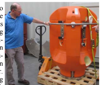
Float shown in top right of photo to left.

system is designed so that every summer some scientific instruments can be replaced using Remote Operated Vehicles (ROVs) that can 'plug in' new instruments into the junction boxes on the seafloor. We have been asking for a "Fishermen's Web Page" with information of interest to the fishing industry such as surface and bottom current speed and direction, sea temperatures, thermoclines etc.